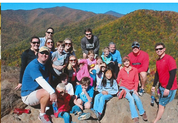
CHILD CARE AND YOUTH CLASSES