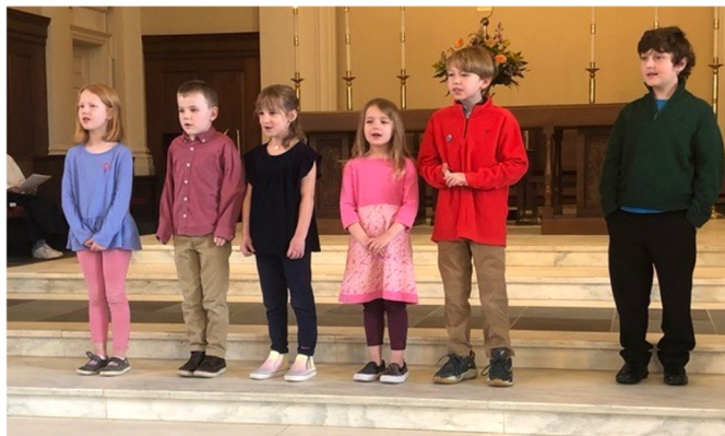
Children's Choir singing during Worship