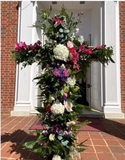
Easter 2023—Flowering of the Cross